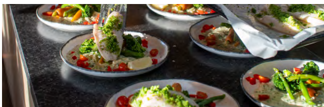
DAY ONE // WEDNESDAY 22ND APRIL 2026 Te Anau

TRANSPORT FROM QUEENSTOWN: 2:30pm (onwards) at most central hotels (excludes private residence) OR: 3:00pm at The Station Building, Duke Street OR: 3:30pm at Queenstown Airport OR: Make your own way to Te Anau and check into the Distinction Hotel & Villas.