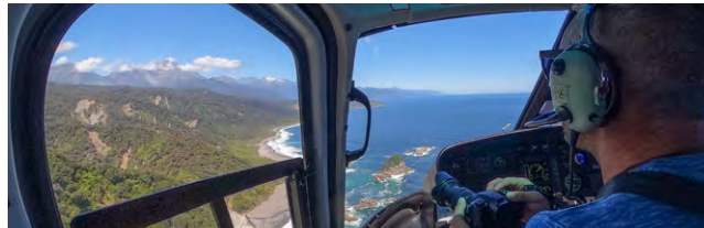
DAY FOUR // SATURDAY 25TH APRIL 2026 Waitai Lodge to Te Anau/Queenstown

You will use a day pack to carry your jacket, camera etc.