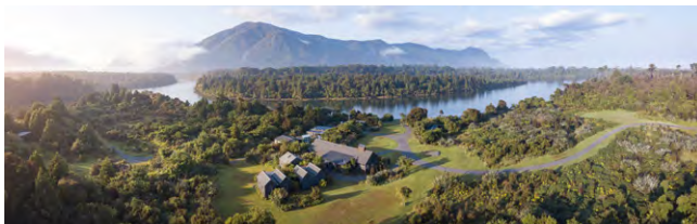
DAY THREE // FRIDAY 24TH APRIL 2026 Waitai Lodge & Martins Bay Area

ACCOMMODATION: Distinction Hotel & Villas, 64 Lakefront Drive, Te Anau